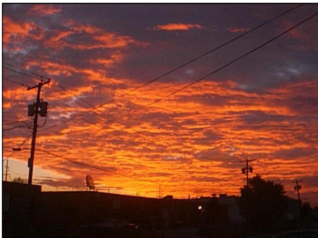
A Beautiful Hicksville Sunrise