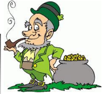
'Of course L'm smilin'...L've got the gold! Happy St. Patrick's Day!'